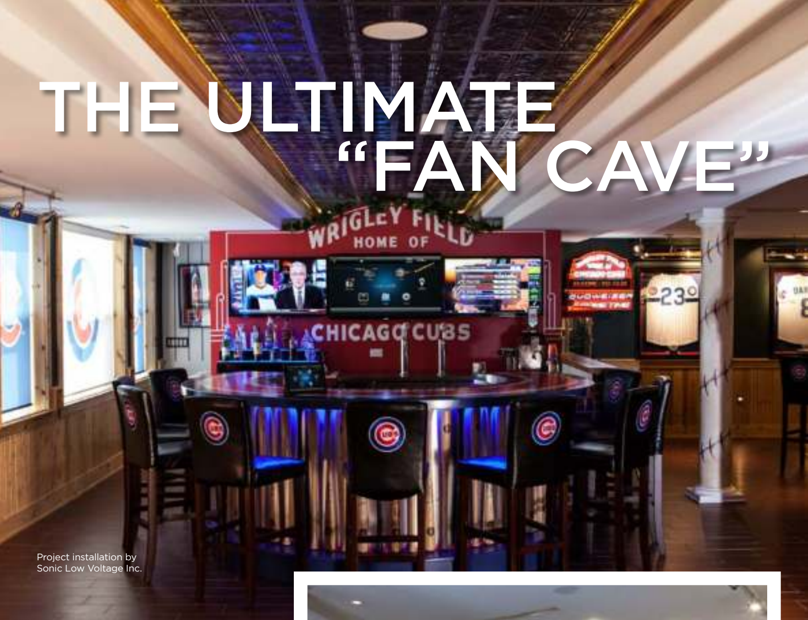
Project installation by Sonic Low Voltage Inc.