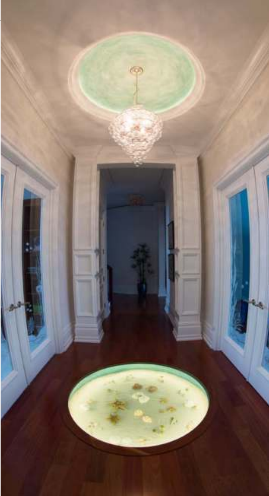
All of the technology is hidden behind the scenes, allowing the home’s maritime theme and luxurious lighting to take center stage.

The owner’s wife has her own favorite features. “It’s a party house,” she explains. “The best part is, we can have every light in the house on, and when the party ends, I can hit one switch and all the lights in the house go off. I don’t have to run around to every room.” Ever social, this couple can host a pre-party, stop at the back door on their way out, hit “HOUSE OFF” and they’re on their way to the next soiree. Security is a big part of this system as well. The owner can access the house from anywhere in the world through his phone or computer to check on the security cameras, or adjust the lights or temperature. “When I’m away from the house,” he notes, “I can still control what’s going on, inside and outside.” After experiencing less than stellar results with other systems, this owner is pleased to have found Control4. “It’s a difference between night and day,” he notes. “I’m 100 percent happy with Control4, and if I ever built another house, I’d use it again.” ■