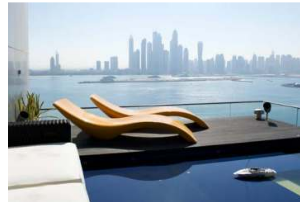
While it's practically invisible, automation abounds in all rooms of the penthouse, left . Relax by the pool and watch a movie on the self-positioning TV, or, take in the sweeping Dubai skyline, above .

The system itself truly is awe-inspiring. "This project is arguably the highest specification residential