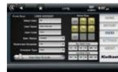
Schedule User Access