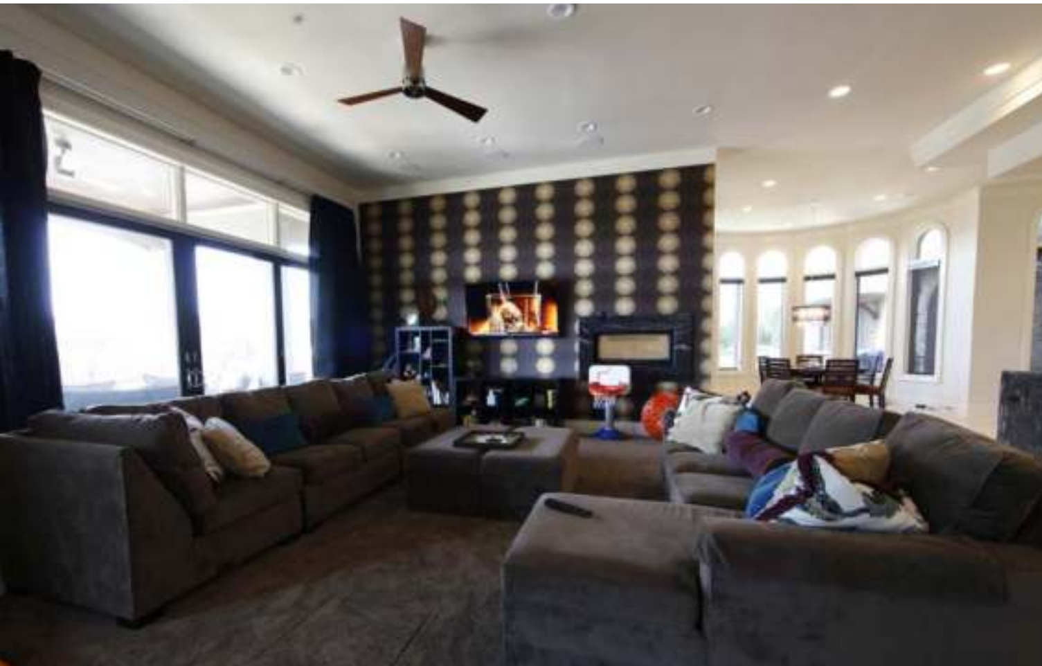
Living room loungers can access their own personalized video options on the big-screen TV, while others watch a separate source in the adjacent kitchen.

really useful to have those buttons on the wall. A lot of times it's a challenge to find those remotes. Just to be able to go to a TV screen or any of the buttons on the wall, is very helpful."