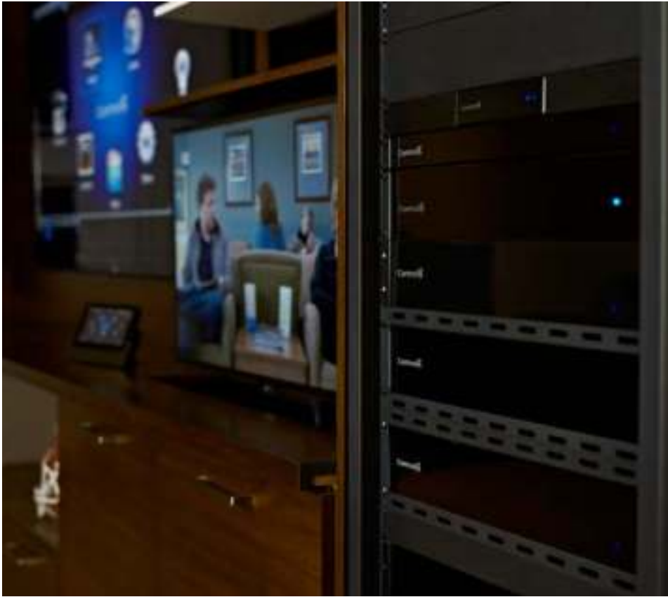
Fewer components, more entertainment: Store your satellite receiver, Blu-ray player, TiVo DVR, Roku player, etc. in one centralized location but enjoy them anywhere in the house.

The modern version of multi-room audio/video—or whole-home media distribution, if you will—is just as simple (often simpler) to use, sounds way better, is much more useful, and