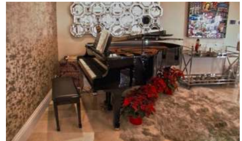
The Kane family gathers weekly in their home theater to watch a feature on their automated 103-inch projection screen, above . The supersmart family piano can be broadcast throughout the house, and, can be played remotely from such faraway places as Japan, below .