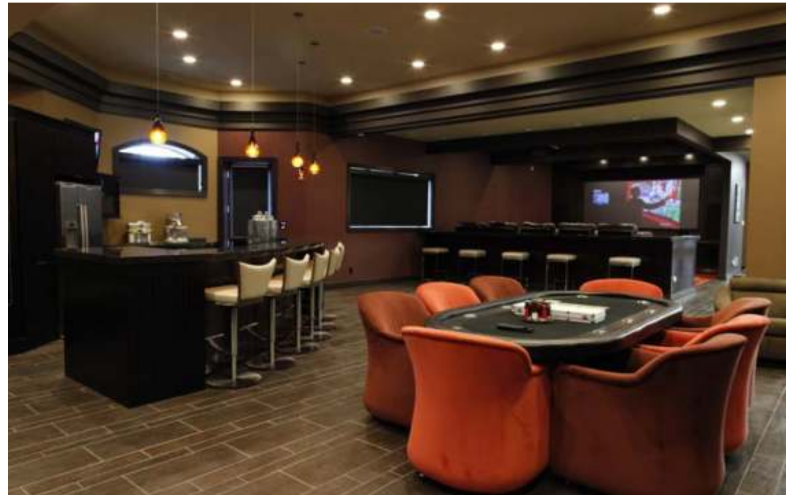
One touch of a button prepares the basement "man cave" for a superbowl party, poker night, or post-game cocktails.

The owner's favorite features include the door station intercom ("no more of those solicitors at the front door," he says), and the ability to access the system remotely.