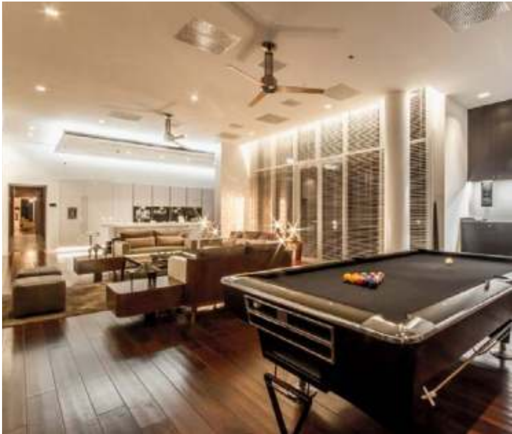
Every room adheres to the owner's strict aesthetic direction: sleek, futuristic, and modern, right . Aside from a few touch screens, the automation system works entirely behind the scenes, left .

complex processes are running in the background, this was always intended to be a project that “simply works, simply,” he notes. “Without the owner even considering it, the technology lives in parallel with him and his guests. Every scenario is anticipated and reactive so the only real interaction needed is when absolutely necessary, such as selecting a playlist, movie or even ‘I’m going to sleep now.’