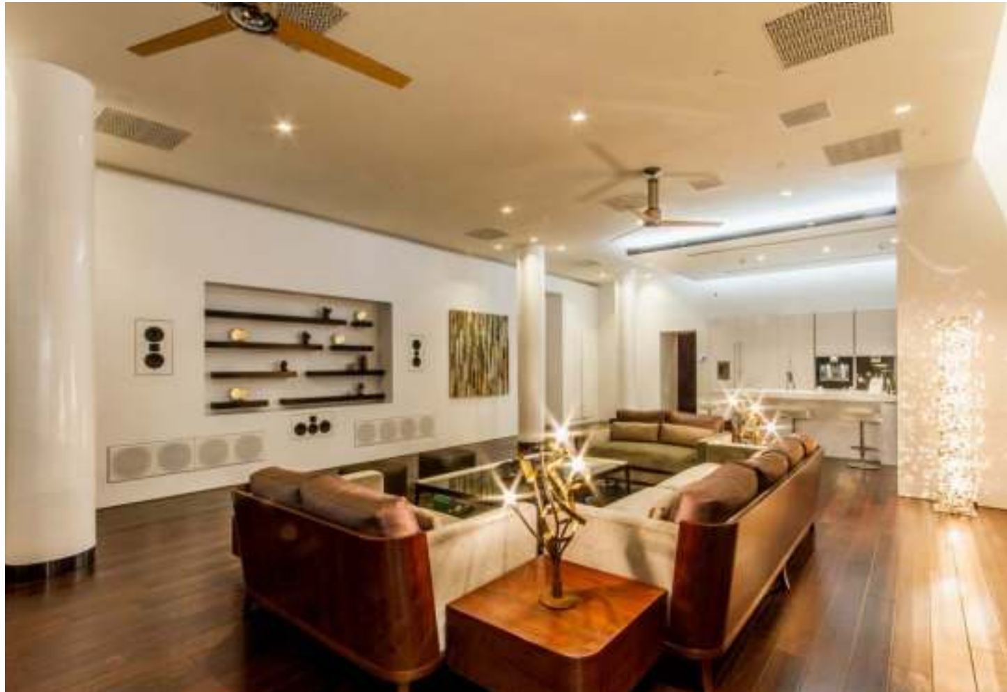
Invisible sensors detect when someone approaches any room, and automatically turn on lights in anticipation, above . The living room, transformed into full cinema mode, right .