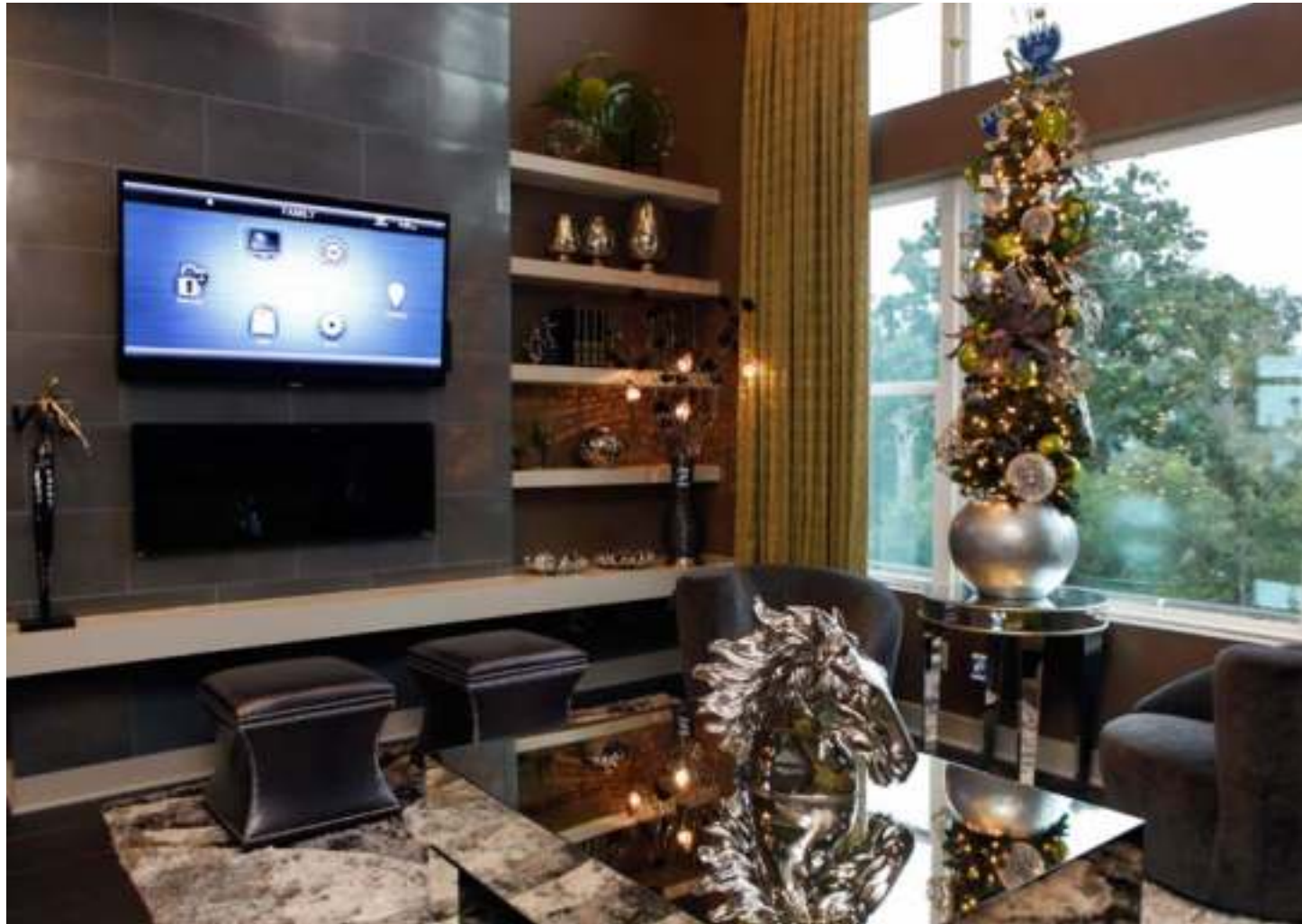
Automation is everywhere in the park, from in-house audio and video systems, to exterior speakers that line Main Street.