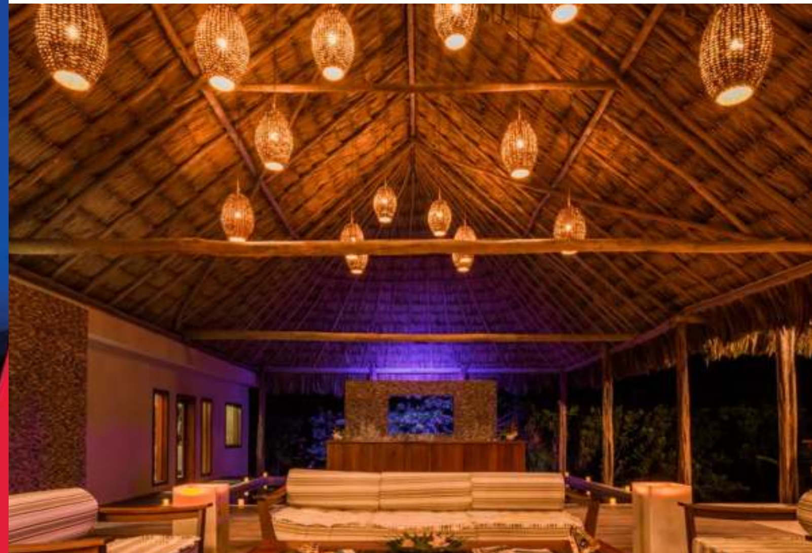
El Secreto's social area by night. Balmy weather courtesy of Belize; lighting by Control4.