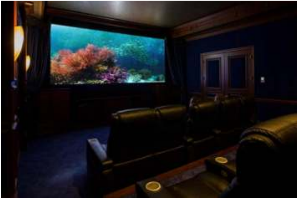
The home theater features a 185-inch movie screen, three rows of extra-large theater seats, and countless video sources.