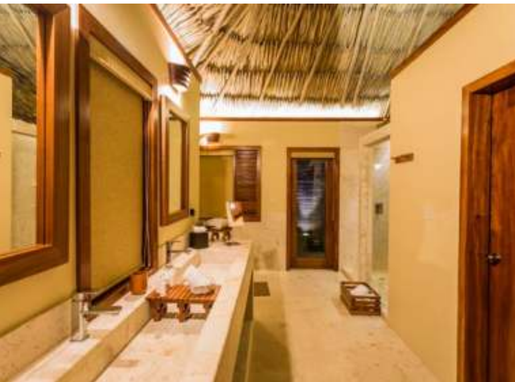
A bedroom in one of the Sea Villas, above . First class amenities and services ensure that you never want to leave, below .

face-to-fish with that spectacular reef, but the land amenities make an equally impressive splash. Namely, the 13 individual villas spread throughout the property—we can choose a “tropical villa,” a “sea villa,” a “lake villa,” and the much-coveted “spa villa.” With only one party to a villa, and only 13 villas, we’re guaranteed an intimate retreat.