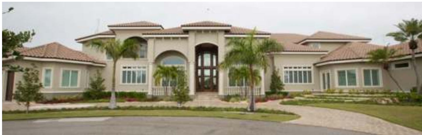
Extra-large windows and an open-air design allow copious amounts of natural light into the home.

“I’ve always tried to stay up with the latest gadgets out there,” the owner notes. “I liked the Control4 system