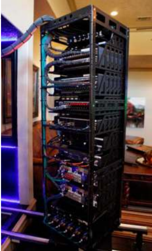
Visitors get hands-on experience using smart home systems, touchpanels, and iPad controls, and can check out live system hardware up close and personally.