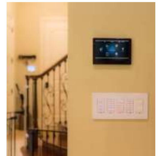
Upstairs, family members can control lighting with the touch of a button. Televisions, touch panels, and light switches all offer access to the automation system.