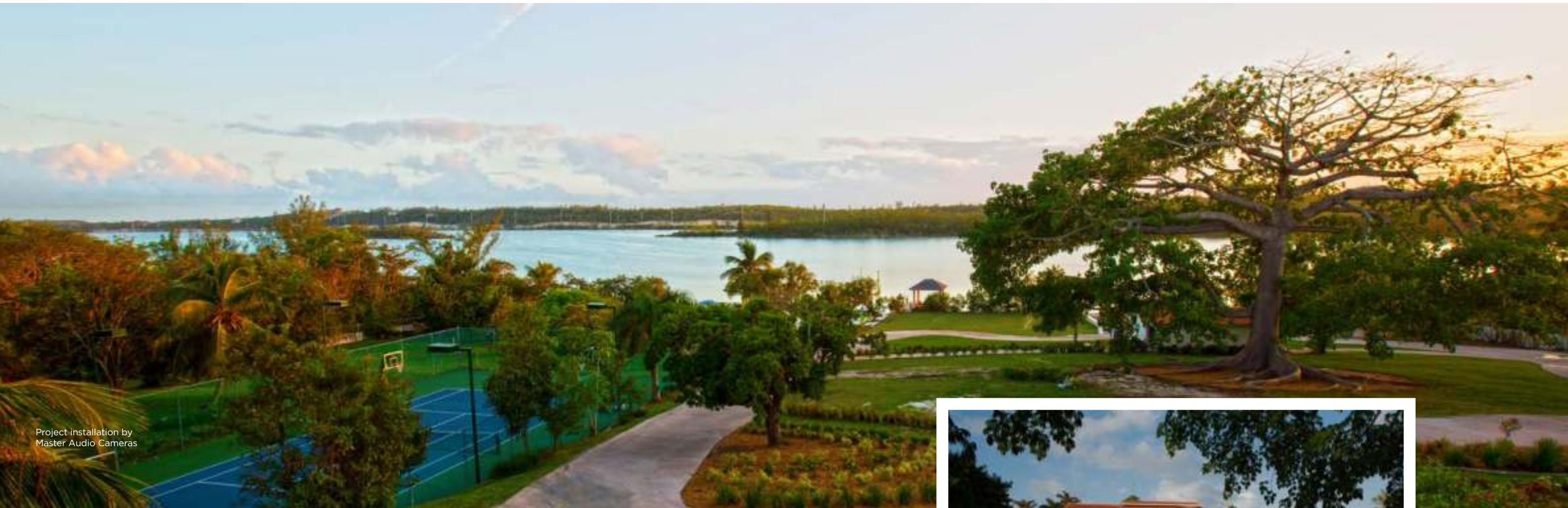
Project installation by Master Audio Cameras

Property developers in paradise build a high-tech home for their most challenging client—themselves