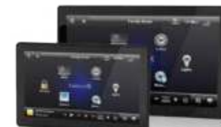
On Screen Compatible