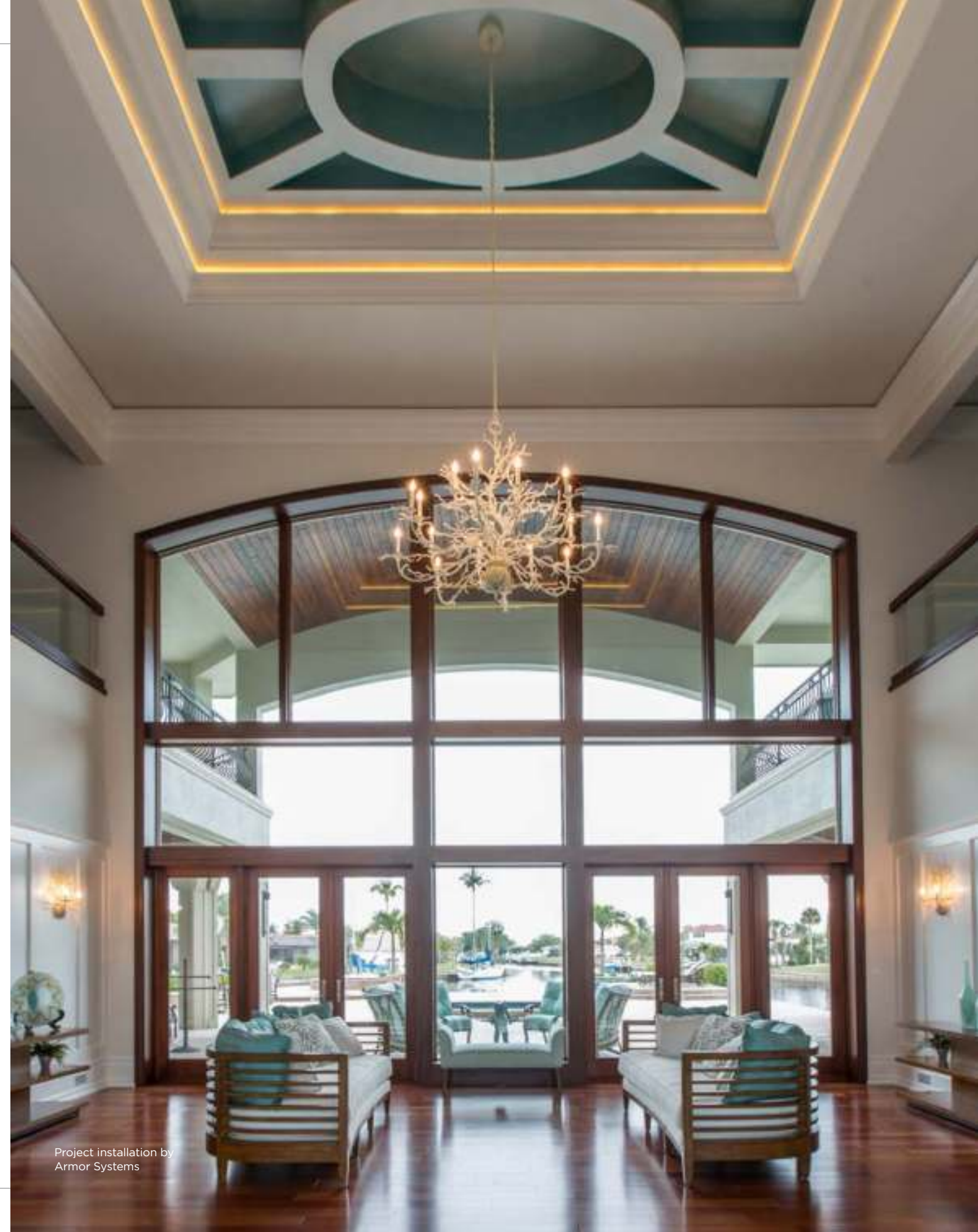
Project installation by Armor Systems