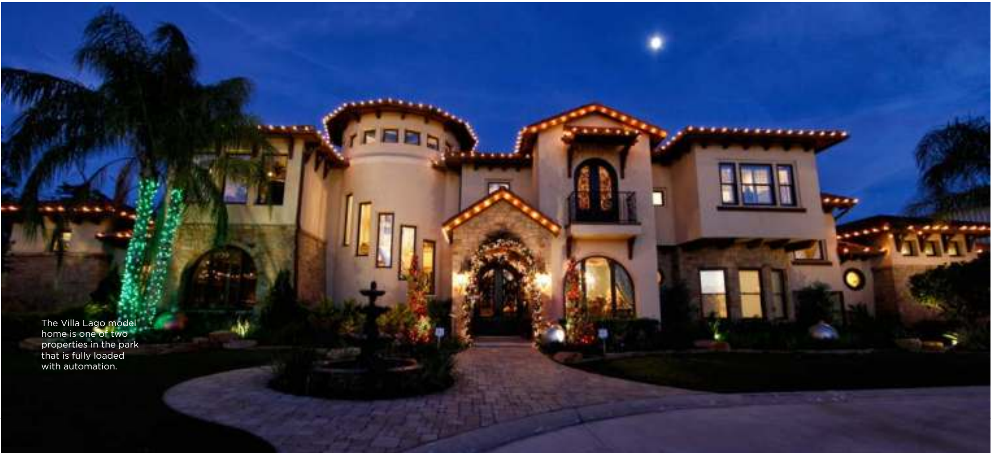
The Villa Lago model home is one of two properties in the park that is fully loaded with automation.

Ready to visit? Here's how it works: As you enter Main Street America, the first thing you do is grab your TED guide. TED is actually a tablet, designed specifically for the Main Street America experience. Every time you see a designated logo on a tag or placard, you're welcome