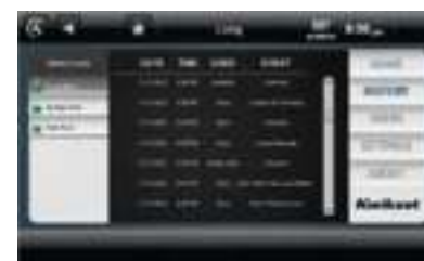
Real-Time History Logging

Download the improved Kwikset App in the 4Store